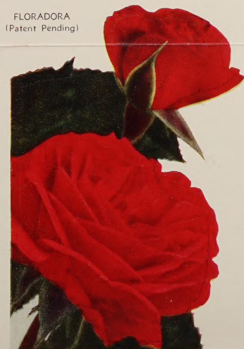
FLORADORA (Patent Pending)